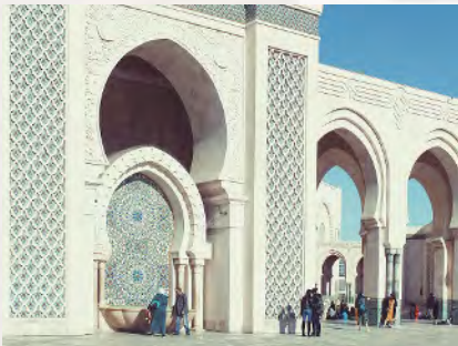
1 night in Casablanca

ADD 2-NIGHTS IN MARRAKECH APRIL 30-MAY 2, 2025