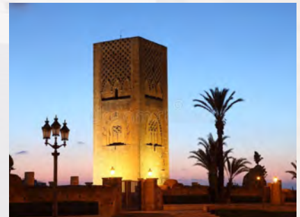
2 nights in Rabat