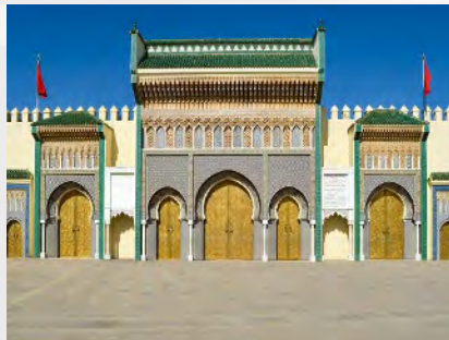
3 nights in Fes