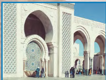
2 nights in Casablanca

OPTIONAL PRE-TRIP EXCURSION TO MARRAKECH OPTIONAL POST-TRIP EXTENSION TO TANGIERS