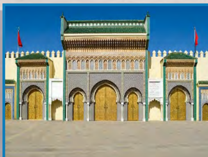
3 nights in Fes