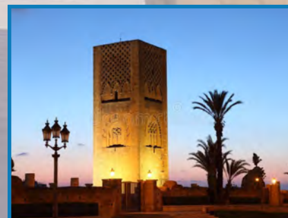
2 nights in Rabat